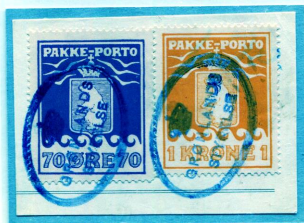
Parcel card piece: Two Copenhagen crowned oval cancels (1925–38), Grønlands Styrelse , on perf 11½ 70 øre and 1 krone [T2 Facit P10, P11]

20 øre perf 11½ [T2 Facit P9] examples with cancels from settlements in Qaasiutsup (NW Greenland).