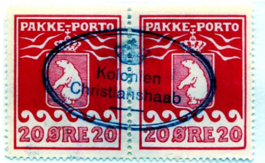
Crowned oval, two line Kolonien Christianshaab [Qasigiannnguit (1253)]