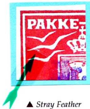
▲ Stray Feather