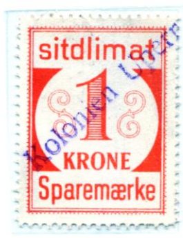
Cancelled stamp from redeemed savings book

Sitdlimat (Greenlandic), Sparemærke (Danish), — Savings stamp