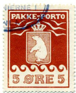
5 øre Oval cancel Styrelsen af Kolonierne i Grønland T2: Thiele II [P6]

The various denominations and printings of the Polar Bears, and the cancellations from different offices, are the main subject of this one-frame exhibit. Examples on part or entire parcel card are prized. Beside parcel post, the Polar Bears were coopted for another role. Absent a formal banking system, in the mid-1920s a special savings scheme was introduced to assist outlying communities. Savings booklets could be gradually filled with Polar Bears, and later redeemed at face value. In 1938, postage stamps superseded Pakke-Post stamps, so new style savings stamps were introduced: examples of each denomination are shown. Honouring the Pakke-Post, in 1983-85 Greenland issued special Polar Bears sheetlets, printed from the original plates.