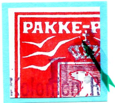
▲ Dot by Seagull Wing

The two Savings Books shown here ( Satut 1927, Ritenbenk 1937) contain a total of 72 examples of the 20ø parcel stamp, so represent a large and rather natural sample of these stamps. Close examination reveals four constant plate varieties, none of which is described in the Facit Special catalogue (though the “Dot by Seagull Wing” is in the same place as the “Square by Seagull Wing”, Facit variety V 5 for the 1kr stamps).