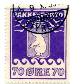
70 øre Steel datestamp GRØNLANDS STYRELSE 9 Oct 1936 T2: Thiele II [P10]