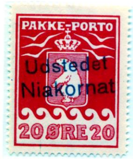
Udstedet Niakornat [Niaqornat (58)]