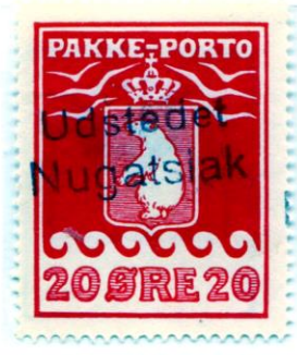
Udstedet Nugatsiak [Nuugaatsiaq (84)]