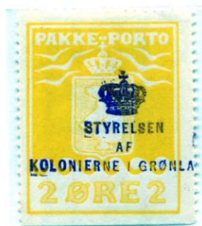
Copenhagen crowned three line cancel (1912–25), Styrelsen af Kolonierne i Grønland , on perf 11½ 2 øre [T2 Facit P5]

Imperf at base (edge of sheet) — a collectable variety ►