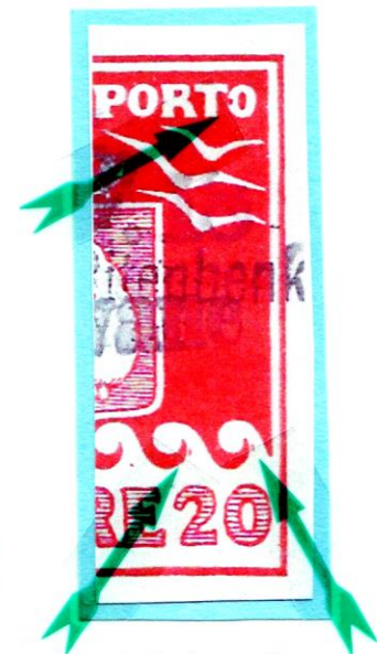
▲ Packman O; Foam Flecks on Waves