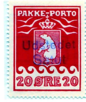
Udstedet Satut [Saattut (212)]