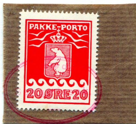
20 øre on savings book piece Red oval cancel (uncommon) Udstedet Sangdessaok (?) S: Schultz [P14]