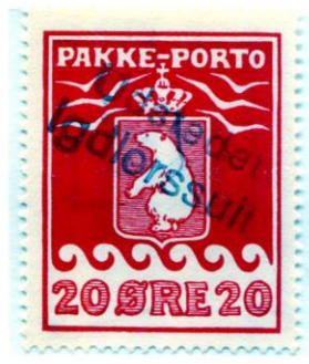
Udstedet Igdlorsuit [Illorsuit (91)]

(2010 population sizes shown in brackets)