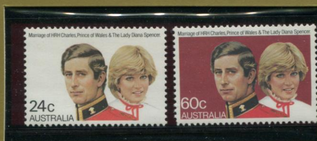
Marriage of HRH Charles, Prince of Wales & The Lady Diana Spencer.

Size (including perforations): 37.5 mm x 26 mm